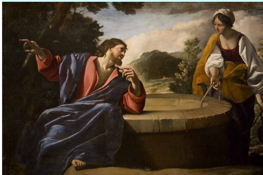
Giovanni Lanfranco (ca. 1625-28)

Newsletter for Catholics in Birkdale 12 th March 2023 + Third week in Lent Sundays Year A + Week Days Year I